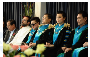
File photo: Last year's Commencement Ceremony held for Academic Year 2011 graduates at STIC Auditorium