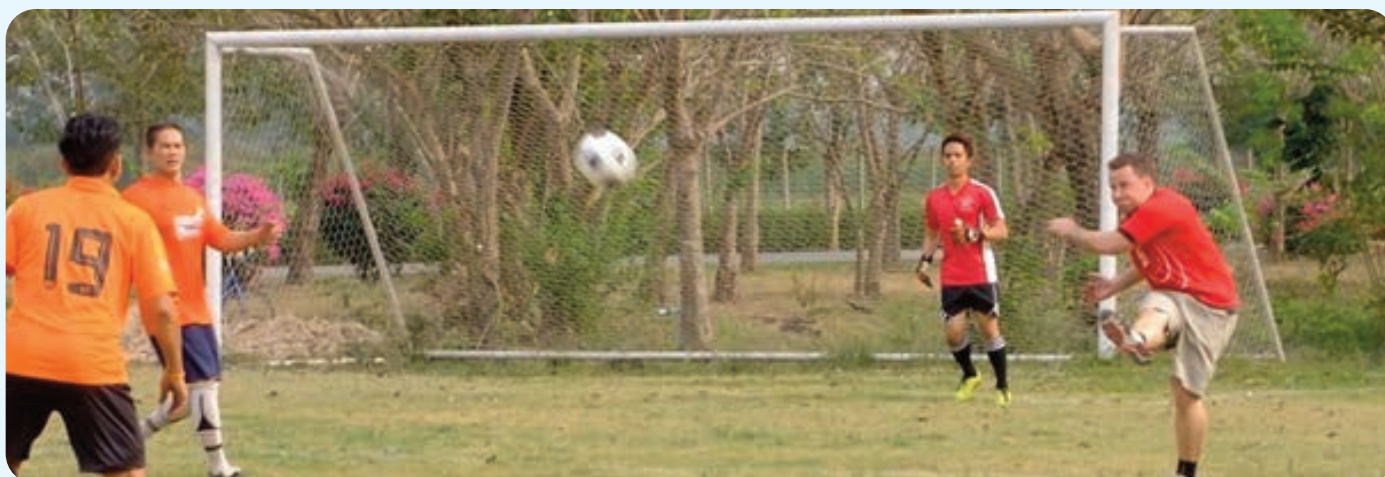
The friendly football match between STIC Team and Look Nang Tidlor VIP Team