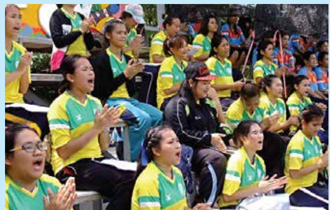
Photo shows : Sports' Day colourful and magnificent parades from the Red, Blue, Yellow and Green entering the STIC sports field while the Organizing Committee Chairman, some members and guests of honour, lecturers, students and staff look on.