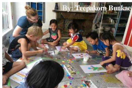
By: Teepakorn Bunkae