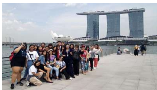
By: Nattanit Sukcharoen

A total of 26 Hotel and Tourism students had a study tour in Singapore and Kuala Lumpur in Malaysia on March 9 – 12, 2019. This trip aimed to expose the HT students to different variety of hotel management structures especially outside Thailand. It gave us the chance to experience international hotel atmospheres and their organizations. We did some activities that were so helpful for our