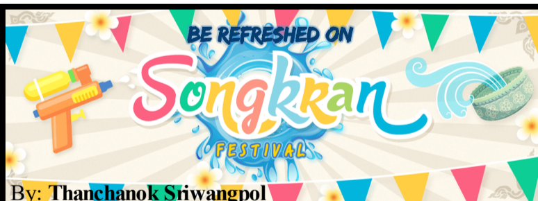
By: Thanchanok Sriwangpol

In conclusion, STIC Summer English Intensive Class 2019 is the most appropriate program in molding our incoming freshies to be well-equipped in all aspects required in the challenging world of college life.