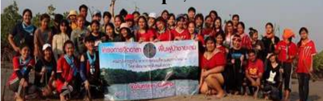
By: Patthanawan Dechasurakchon

We, the Hotel and Tourism students went to Sattahip, Chonburi during January 19-20 to partake in activities with our seniors. This is actually like a volunteer camp because the event's objectives were to help other people, live and work with them while we travel. We were grouped in teams for us to be more familiar with other HT students. We did many activities such as snorkeling, planting trees in the mangrove forest, and cleaning the beach area near our accommodation. We also visited the H.T.M.S Chakri Naruebet (flagship of the Royal Thai's navy) and visited the