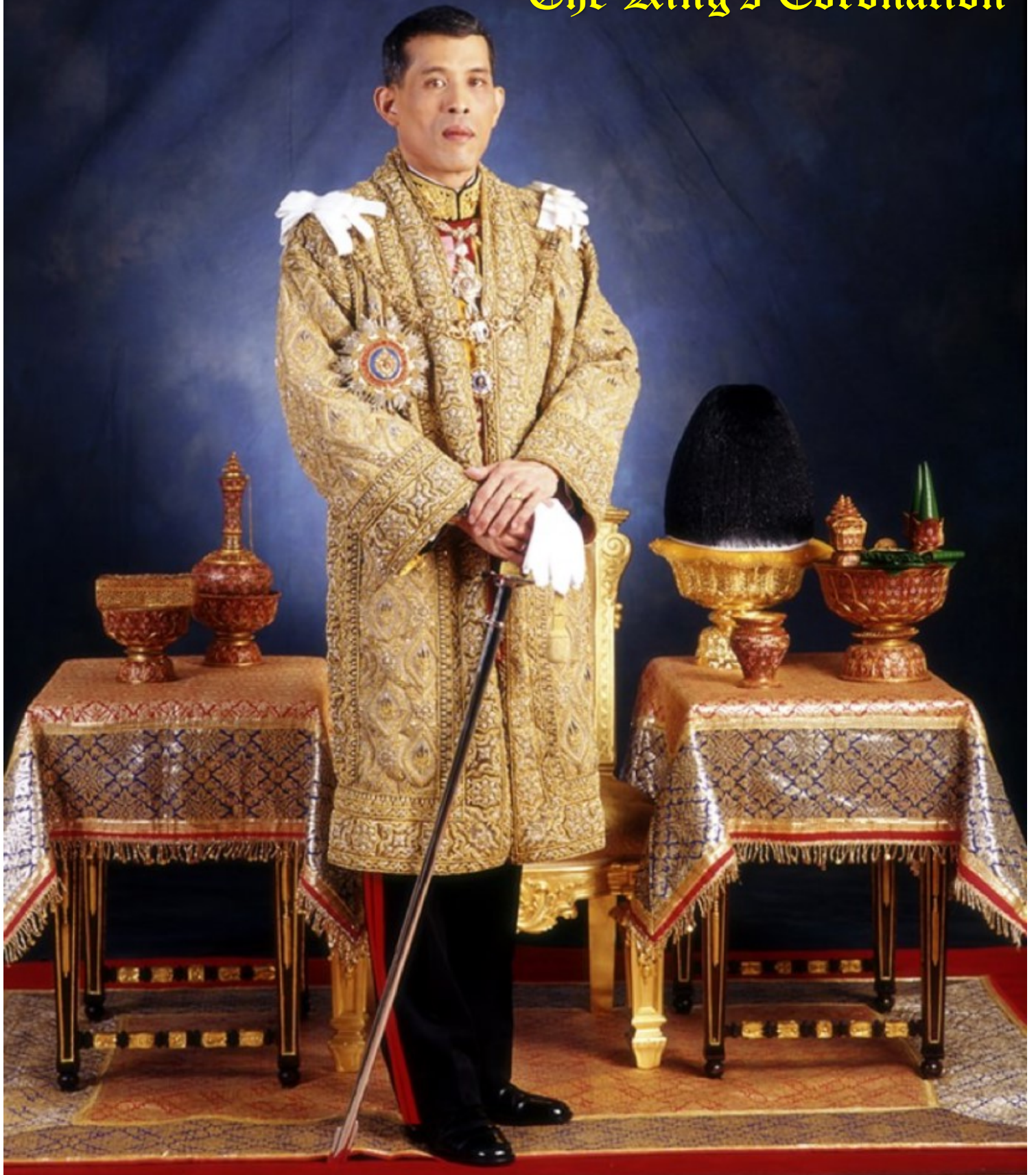
His Majesty King Maha Vajiralongkorn Bodindradebayavarangkun