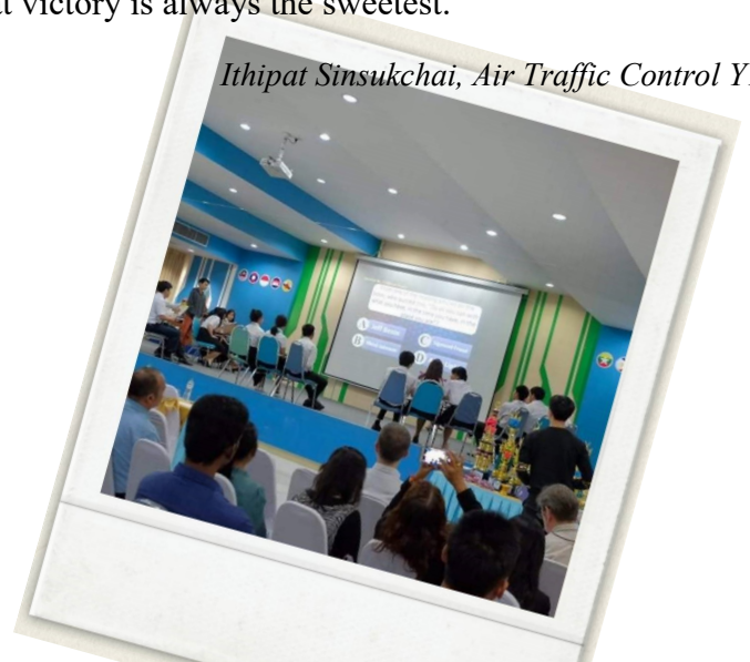
Ithipat Sinsukchai, Air Traffic Control Y1

Teerasak Yuangkham, Communication Arts Y1