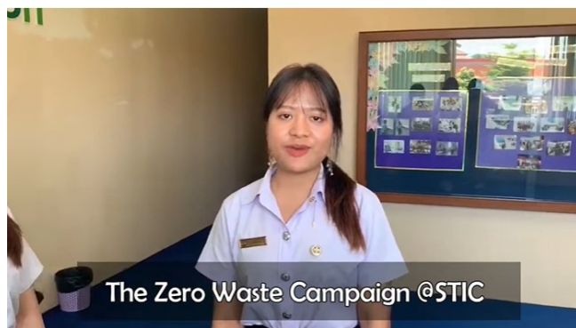
The Zero Waste Campaign @STIC

With the increasing environmental issues on garbage management around the world, a group of concerned STICians initiated the “Zero Waste Campaign @ STIC”. It intends to gradually reduce these problems around the campus until all STICians are fully aware of the beauty and safety of spending time in an unpolluted environment.