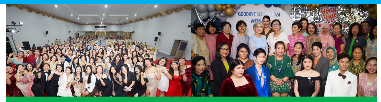
NURSING SCIENCE'S GOODBYE SENIOR PARTY AND COMMENCEMENT CEREMON